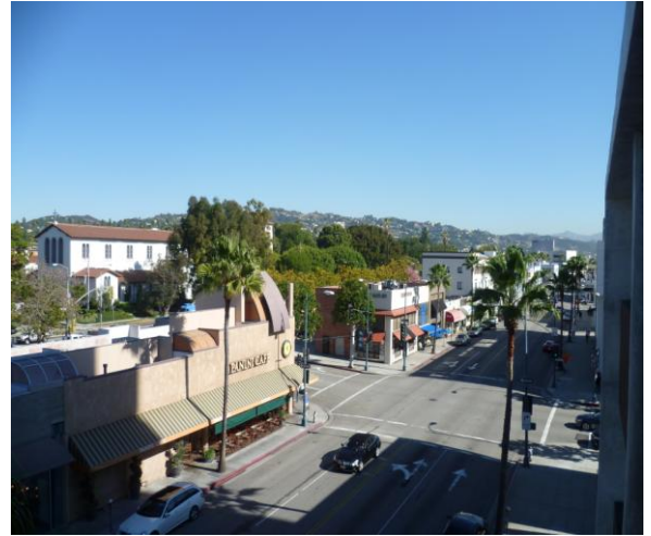
Santa Monica Blvd. to the East