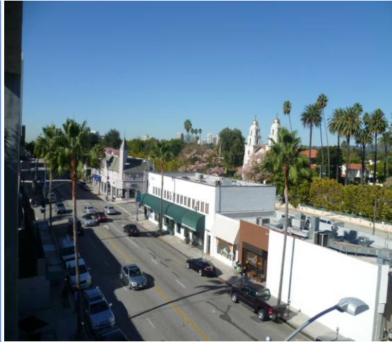
Santa Monica Blvd. to the West